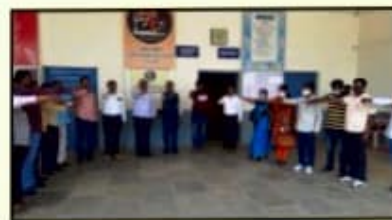
Constitution Day Celebration