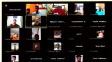
Online guest lecture on National Voters Day