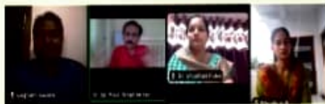
Online STRIDE 3 days SCEP Date 10 to 12 June 2021