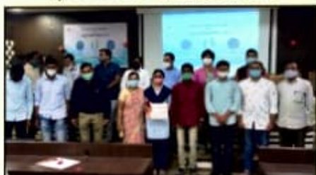
Students appreciated by Hon'ble District Collector Anchal Goyal Madam