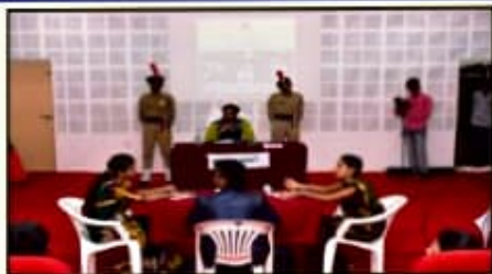
Mock Parliament session was organized by students on 29.02.2020