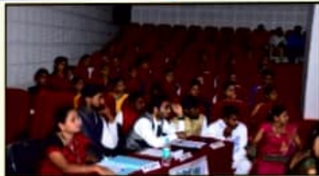
Students participation in Mock Parliament