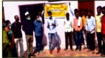
Election literacy Board Activity at Gram Panchayat Asola