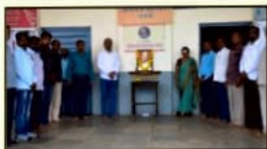
Birth Anniversary of Raje Umaji Naik