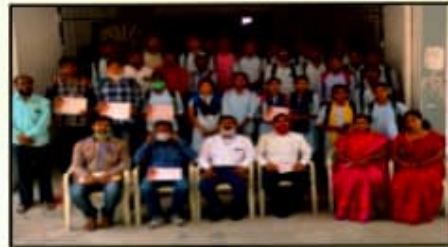
One the occasion of certificate distribution in various competitions organized by the Department of Political Science