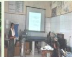
Pre Ph.D viva