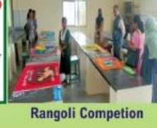
Student Capability inance Programme